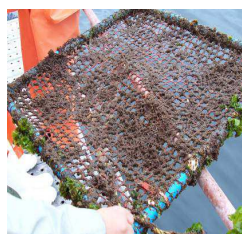
Polymer mesh with anti-fouling coating