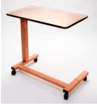
Antimicrobial copper overbed table

For further information, or hi-res images, contact: