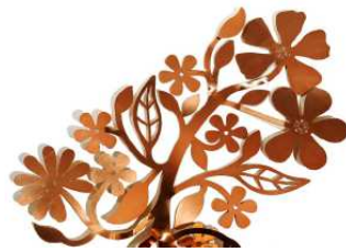
Flora , Tord Boontje