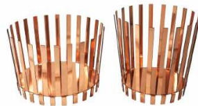
Bend , Nendo