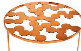
Bubble , Nendo