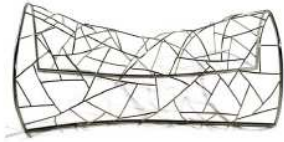
Growth , Eli Gutierrez