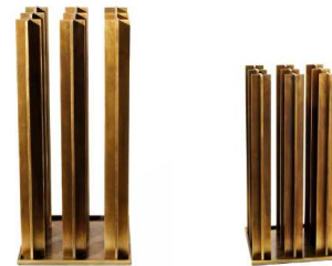
Umbrella Stand , Bassam & Fellows