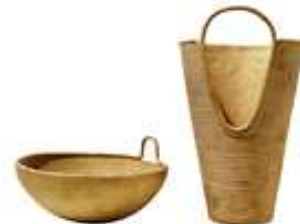
Bell Metal Objects , S. Pakhalè

All these and more can be found at www.copperindesign.org .