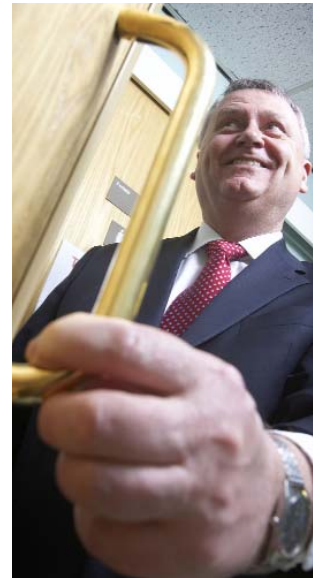
Professor Tom Elliott

The next phase of the Selly Oak trial will see the full range of copper surfaces and their controls tested over a longer period to gather more data.