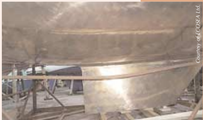
▲ Cupromark subsea marker